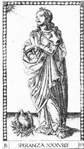
Figure 3. Speranza (Hope) from the Mantegna Tarot(15th Century)

The Mantegna deck does not fit easily into either the playing cards or the “mainstream” Tarot of the period. But it illustrates the type and degree of experimentation that took place in the development of the Major Arcana. Moreover, we shall see that it remains relevant to modern interpretations of the Tarot.