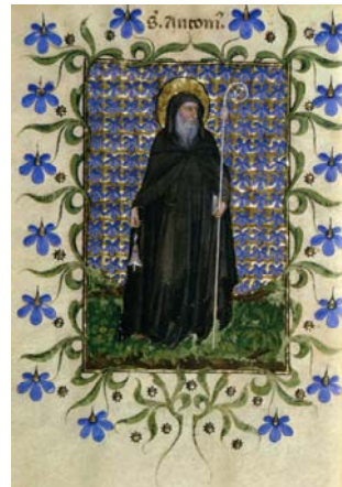
Figure 2. St Anthony from the Besozzo Prayer Book (15th century)

The oldest surviving Tarot cards, and even near-complete decks, date from the middle of the fifteenth century. In 1442 the D’Este family of Ferrara commissioned four decks, each containing the conventional four suits, plus a fifth suit that served as the Major Arcana. Eight cards survive, including one resembling the Lovers. 27