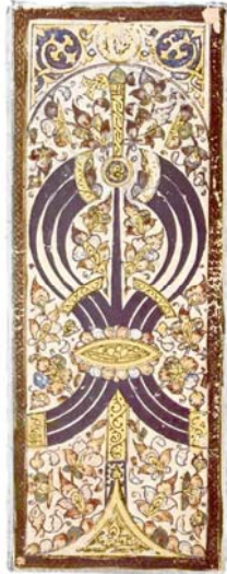
Figure 1. Seven of Swords from the Topkapi Playing Card Deck (15th century)

Since the Chinese deck described by Lu Rong included no court cards, we may conclude that these were added after card games began their westward migration. The court cards of the Topkapi deck bore purely symbolic images because Islam prohibited human representation. 24 When card decks reached Europe, where no such proscriptions applied, the court cards acquired faces. 25 The queen may have been added to the uniformly masculine king, viceroy, and deputy viceroy—the two latter renamed knight and page—in response to instincts of courtly love.