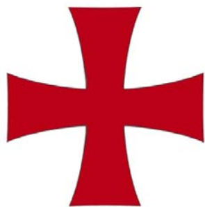
(a) Knights Templar