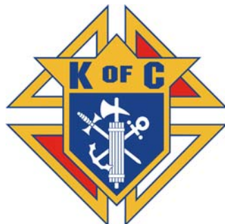
(i) Knights of Columbus