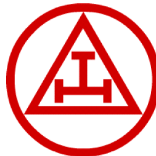
(f) Royal Arch Masons