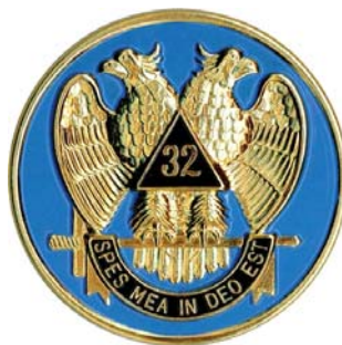
(e) Scottish Rite Masons